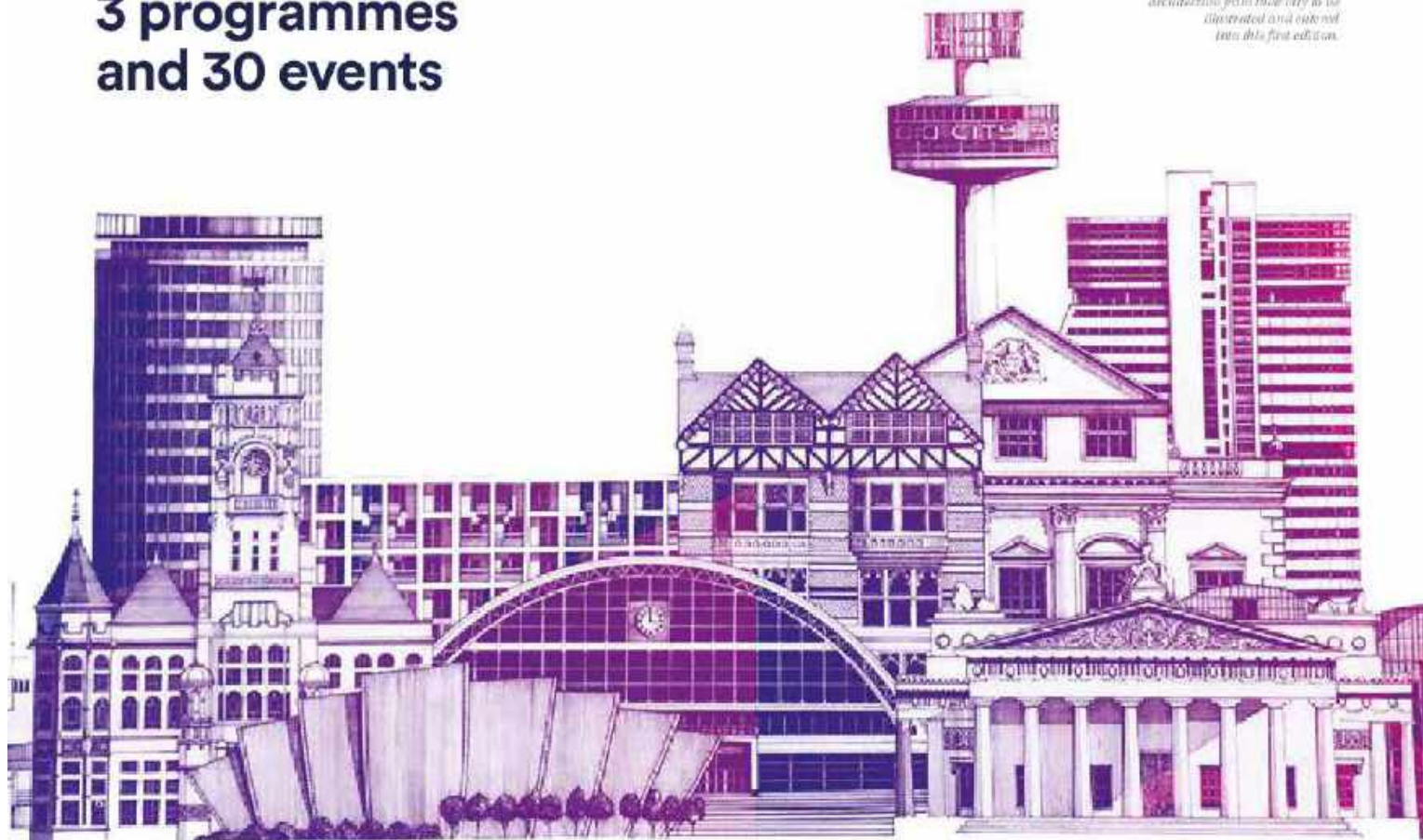
Illustration taken from Specific Skyline 2014 yearbook. 24 practices from around the UK have selected a notable piece of architecture from their city to be illustrated and included into this first edition.